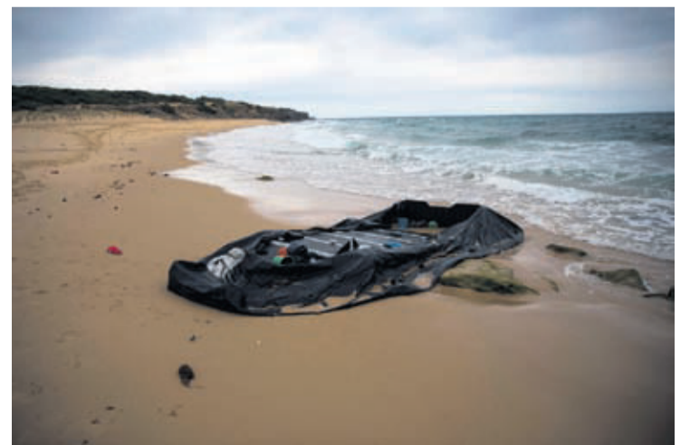
In this Thursday, June 28, 2018 file photo, a rubber dinghy used by Moroccan migrants is seen near Tarifa, in the south of Spain.

the country between 2014 and 2019 were identified, according to a report by the International Committee of the Red Cross. □